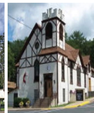
St. Croix Falls Since 1859