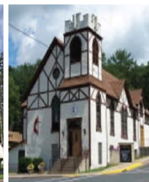
St. Croix Falls Since 1859