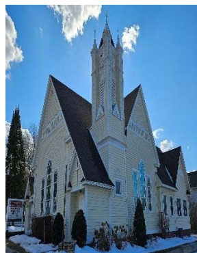
Grantsburg-Central Since 1897