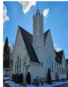
Grantsburg-Central Since 1897

“Mitten Tree Sunday(A)” “2nd Sunday of Advent”