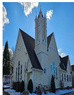
Grantsburg-Central Since 1897

"4th Sunday of Advent" "Christmas program Sunday"