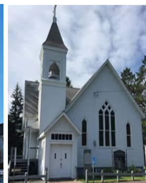
Atlas Since 1887