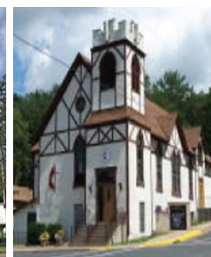
St. Croix Falls Since 1859