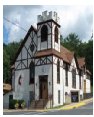
St. Croix Falls Since 1859