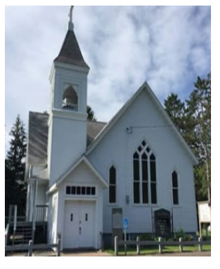
Atlas Since 1887