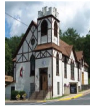
Grantsburg-Central Since 1897