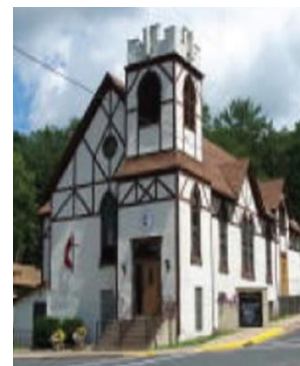
St. Croix Falls Since 1859