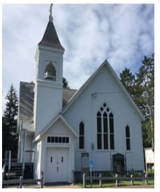
Atlas Since 1887