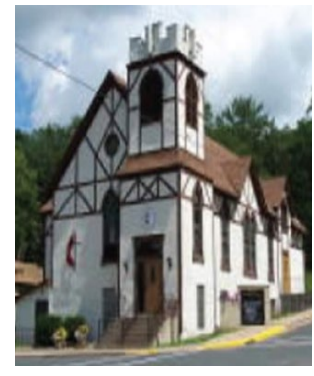
Grantsburg-Central Since 1897