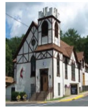
St. Croix Falls Since 1859