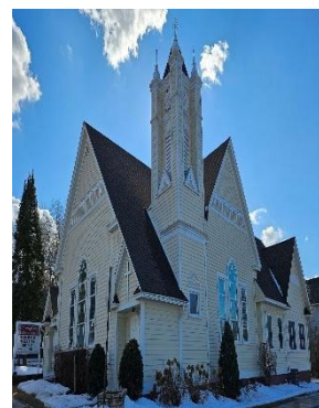
Grantsburg-Central Since 1897

Membership Caring Month 4th Sunday in Lent/UMCOR Sunday