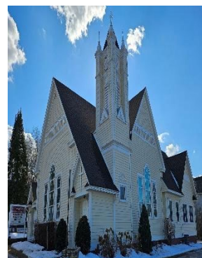
Grantsburg-Central Since 1897

Membership Caring Month 2nd Sunday in Lent