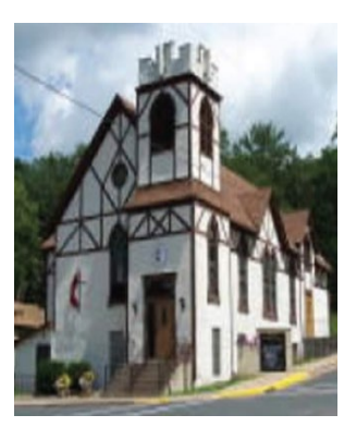
St. Croix Falls Since 1859