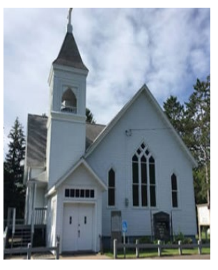
Atlas Since 1887