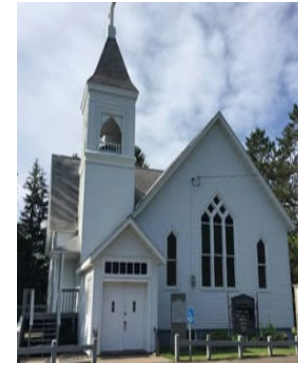
Atlas Since 1887