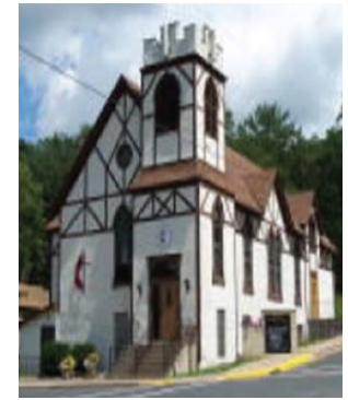
St. Croix Falls Since 1859