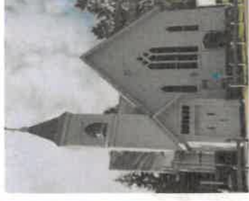
Atlas Since 1887