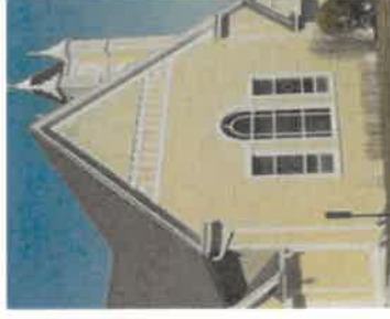
Grantsburg-Central Since 1897