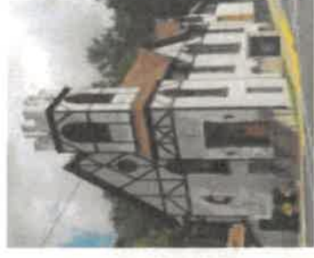
St. Croix Falls Since 1859