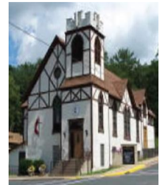
St. Croix Falls Since 1859