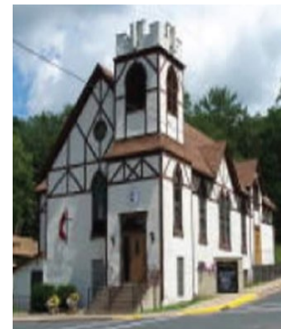
St. Croix Falls Since 1859