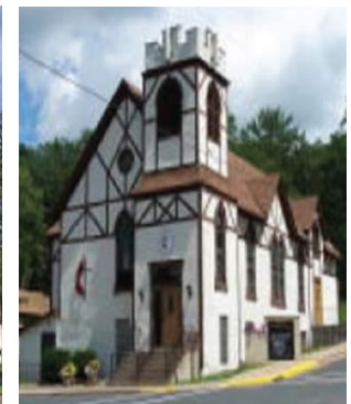
St. Croix Falls Since 1859