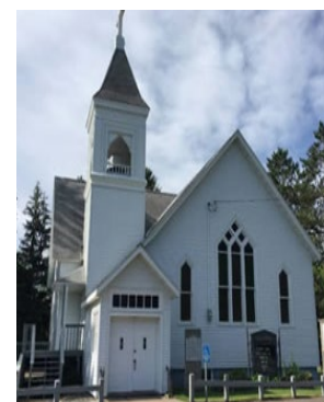
Atlas Since 1887