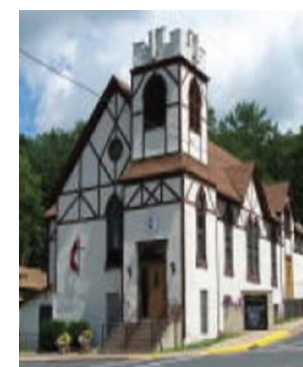
St. Croix Falls Since 1859