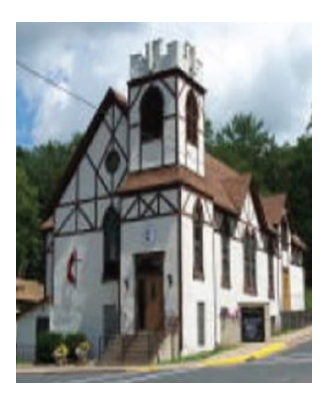
Grantsburg-Central, Since 1897