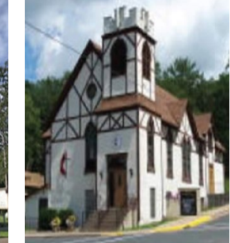
Grantsburg-Central Since 1897