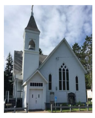
Atlas Since 1887