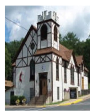
St. Croix Falls Since 1859