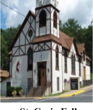
Grantsburg-Central Since 1897