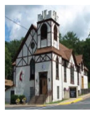
St. Croix Falls, Since 1859