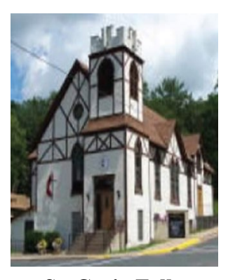
St. Croix Falls, Since 1859