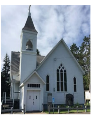
Atlas, Since 1887