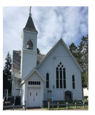
Atlas Since 1887