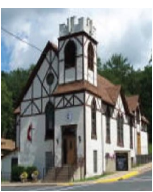
St. Croix Falls Since 1859