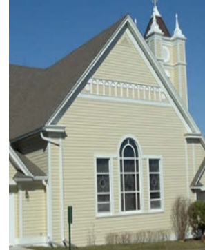
Grantsburg-Central, Since 1897

13th Sunday After Pentecost Blessings of the Backpacks & Animals Sunday Joint Worship Service