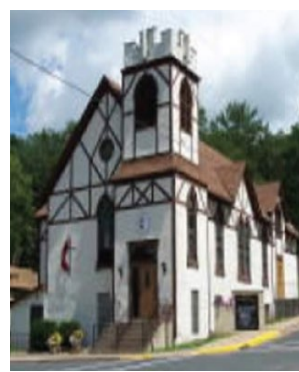
St. Croix Falls Since 1859