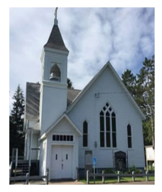
Atlas Since 1887