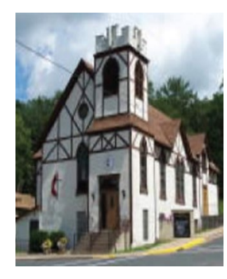
St. Croix Falls, Since 1859