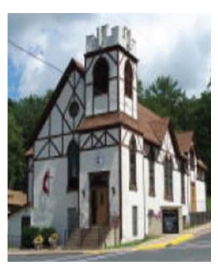
St. Croix Falls, Since 1859