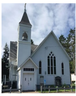
Atlas, Since 1887