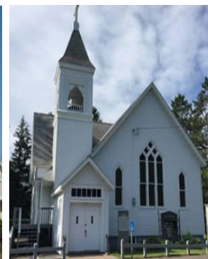
Atlas, Since 1887