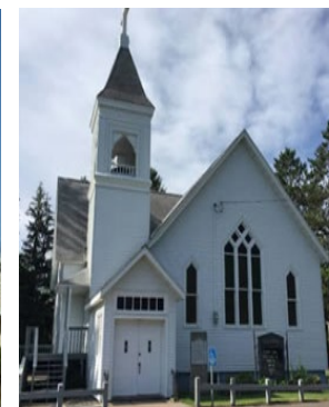
Atlas, Since 1887