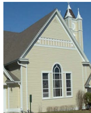
Grantsburg-Central, Since 1897

Fifth Sunday in Lent Membership Caring Month