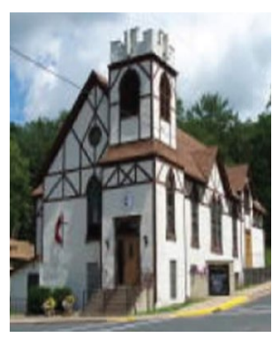
St. Croix Falls Since 1859