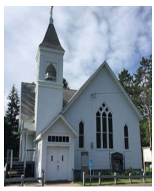
Atlas Since 1887