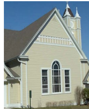
Grantsburg-Central, Since 1897

ONE Parish THREE Churches “8th Sunday After Pentecost”