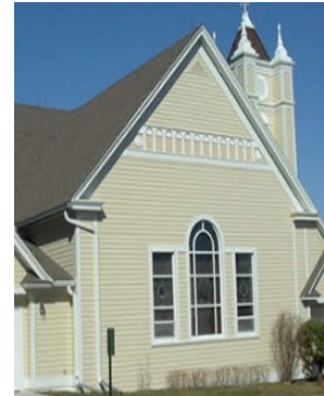
Grantsburg-Central, Since 1897

ONE Parish THREE Churches "7th Sunday After Pentecost"