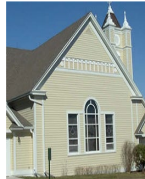
Grantsburg-Central, Since 1897

ONE Parish THREE Churches “6th Sunday After Pentecost”