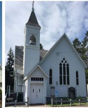
Atlas Since 1887